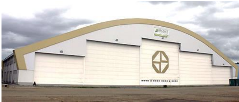
Hangar Exterior completion in August 2016

In 2014, ASI was contracted by Nagaworld Ltd, Cambodia to design and construct a light Maintenance Hangar to international building standards, to meet their unique operational business model. The 5-star Hangar Facility will consist of a multi-story 25m airside frontage x 45m deep FBO building, and a 100m span x 45m deep clear span light maintenance hangar, accommodating a fleet of corporate and business jets up to and including Airbus A320 aircraft.