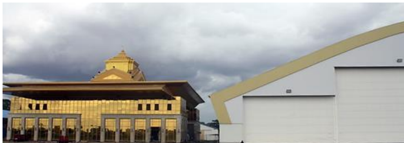
Business Jet – Fixed Base of Operations (FBO) Exterior